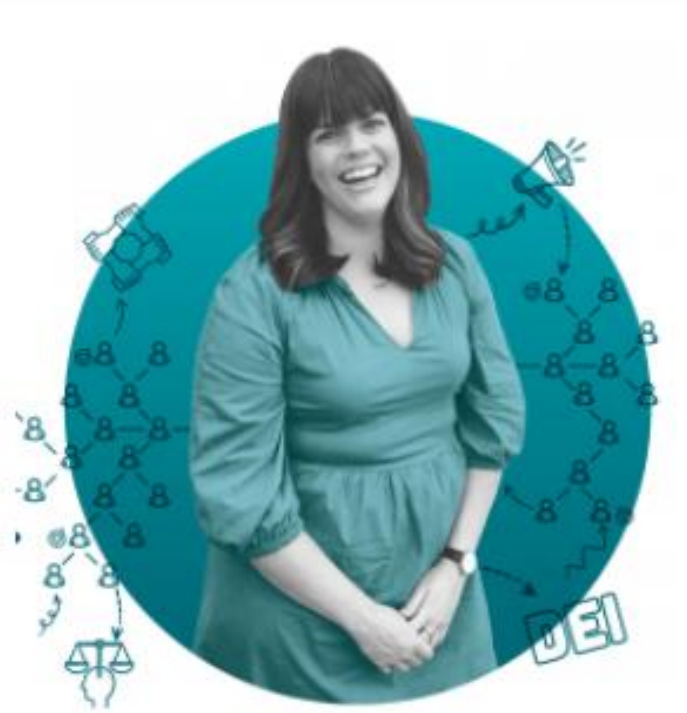
Expand Our Reach