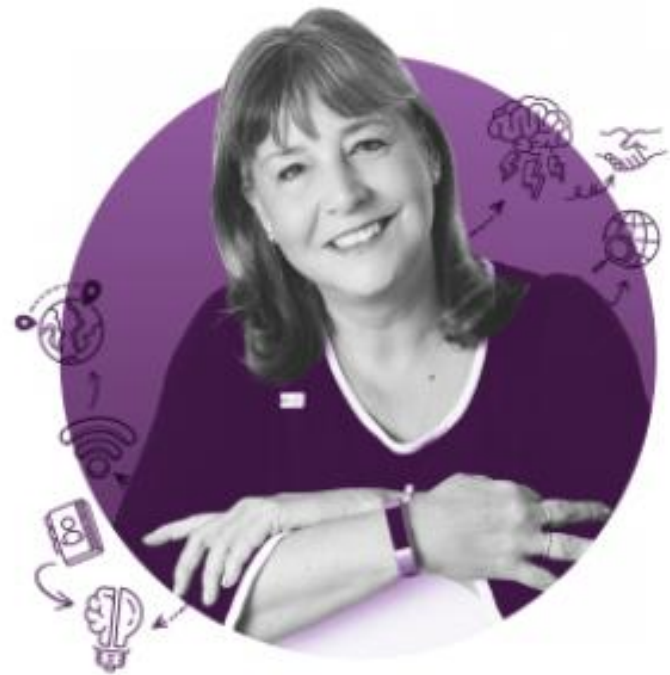
Increase Our Ability to Adapt