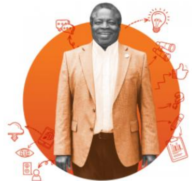
Enhance Participant Engagement